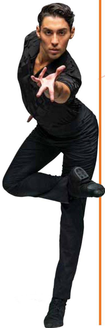
GIORDANO DANCE CHICAGO

Enjoy world-renowned performances at the Midwest region's must-see dance festival where you will be captivated by the artistry of nationally touring professional companies from across the country.