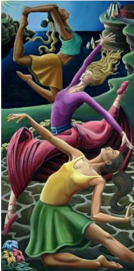
The Three Graces , oil on canvas ▪ David Spear, Columbia ▪ alleywayarts.com created for Sophia's Restaurant, Columbia

Dance St. Louis is one of nearly 400 programs supported by the Missouri Arts Council, the state agency dedicated to the arts for all Missourians